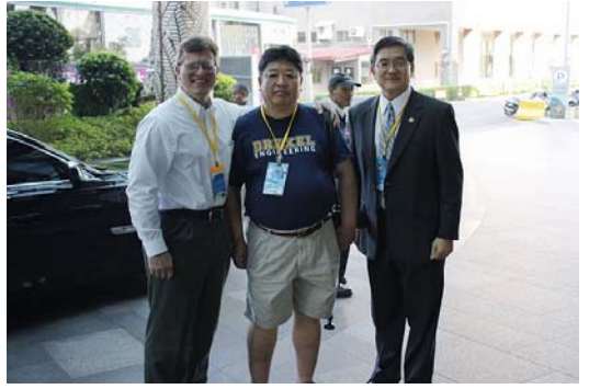
Photographs Taken During the First GSI-Asia Conference